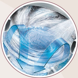
Dual Level Waterfall