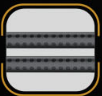
Premium Textured Cable