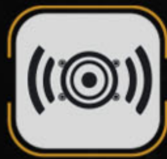
Thumping Stereo Sound