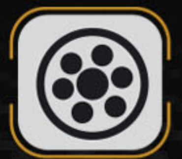
10mm Dynamic Drivers