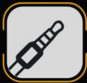
3.5 mm Plug