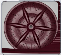
6 Wing Design Pulsator

Multi-dimensional cleaning for total fabric freshness.