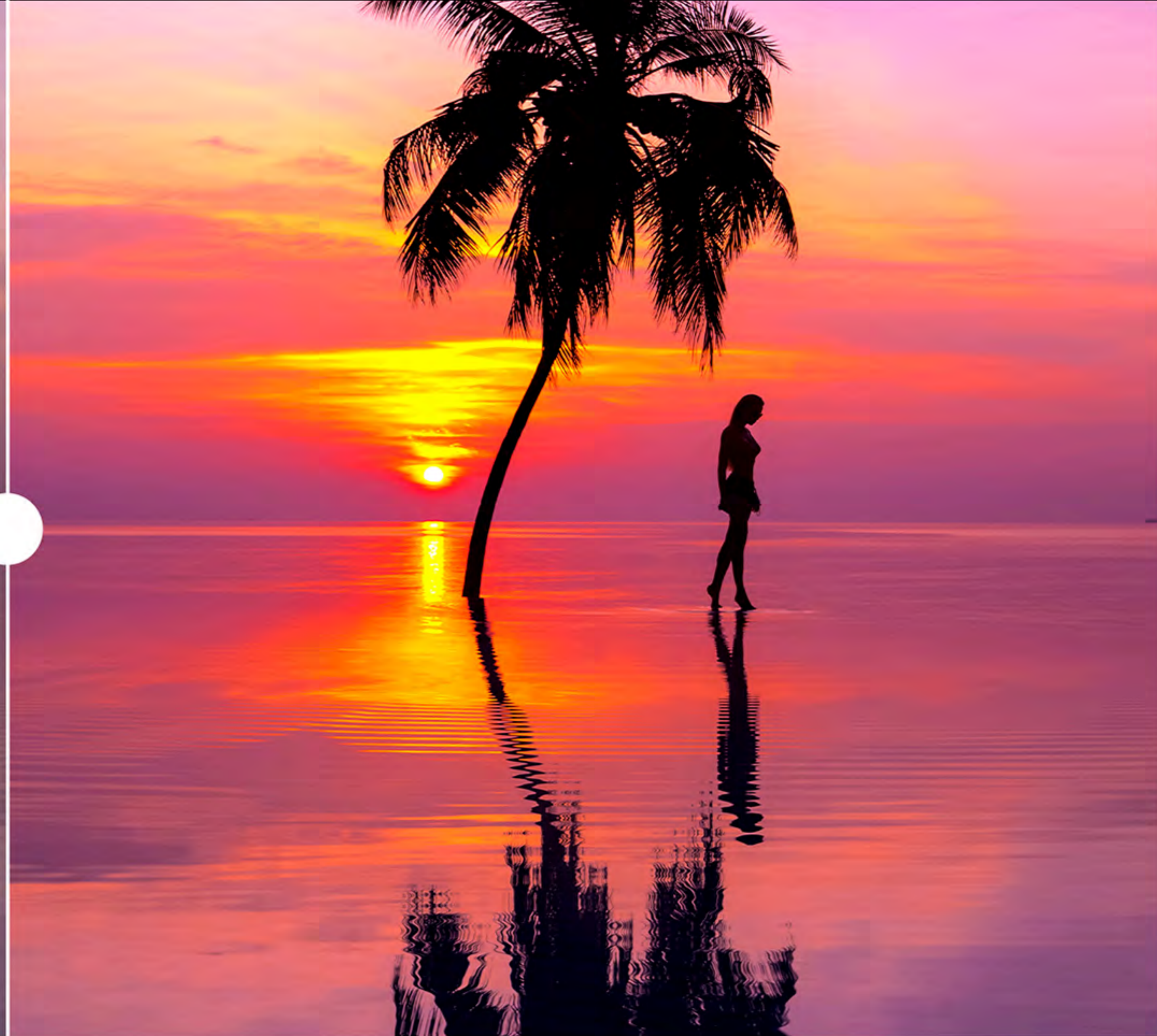
INTEX LED TV