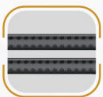
Premium Textured Cable