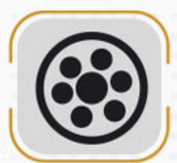
10mm Dynamic Drivers