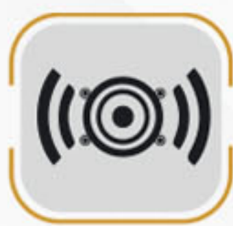
Thumping Stereo Sound