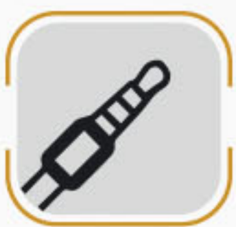
3.5 mm Plug